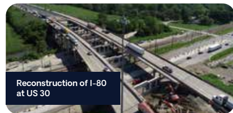
Reconstruction of I-80 at US 30

“Ardmore Roderick’s leadership and coordination were instrumental in keeping this project on time and within budget while ensuring minimal impact on the surrounding community.”