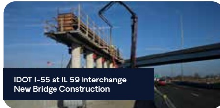
IDOT I-55 at IL 59 Interchange New Bridge Construction