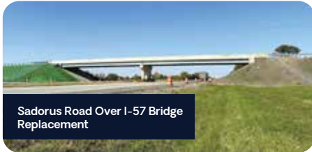
Sadorus Road Over I-57 Bridge Replacement