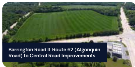
Barrington Road IL Route 62 (Algonquin Road) to Central Road Improvements