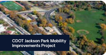
CDOT Jackson Park Mobility Improvements Project