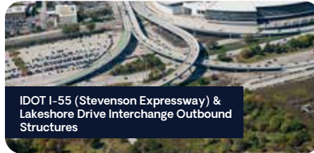
IDOT I-55 (Stevenson Expressway) & Lakeshore Drive Interchange Outbound Structures