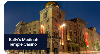
Bally's Medinah Temple Casino