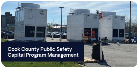
Cook County Public Safety Capital Program Management