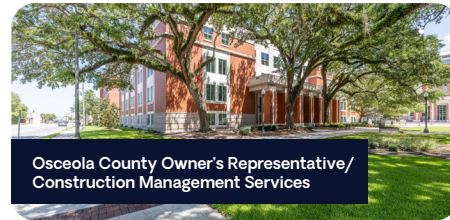
Osceola County Owner's Representative/ Construction Management Services