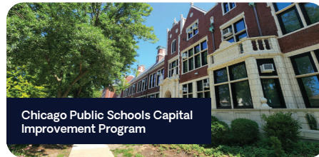
Chicago Public Schools Capital Improvement Program