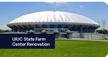
UIUC State Farm Center Renovation