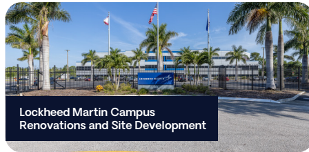
Lockheed Martin Campus Renovations and Site Development