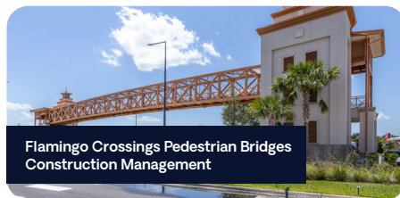
Flamingo Crossings Pedestrian Bridges Construction Management