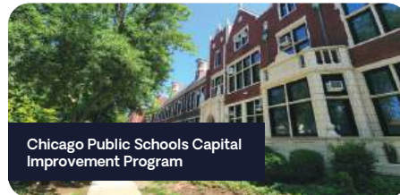
Chicago Public Schools Capital Improvement Program