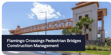
Flamingo Crossings Pedestrian Bridges Construction Management