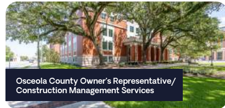
Osceola County Owner's Representative/ Construction Management Services