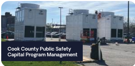
Cook County Public Safety Capital Program Management