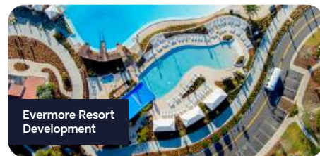
Evermore Resort Development