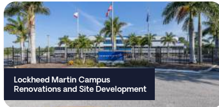
Lockheed Martin Campus Renovations and Site Development