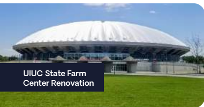
UIUC State Farm Center Renovation